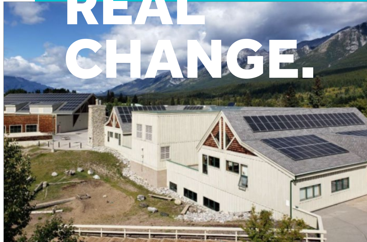
Solar PV array at Canmore Collegiate High School.