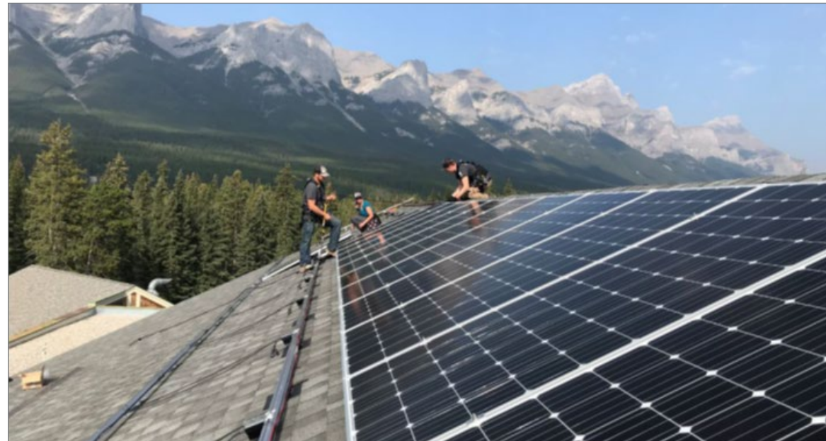
Installers working on the solar PV array at Canmore Collegiate High School.

Initially a third project was also planned for 2019, on Banff Community High School (BCHS). Through the design phase, however, it was discovered that a number of sections of the roof, where solar PV was planned, needed repair. To allow ample time for these repairs to occur, the solar PV project was put on hold and the budgeted funds shifted to an array on Elizabeth Rummel Elementary School in Canmore, planned for 2020.