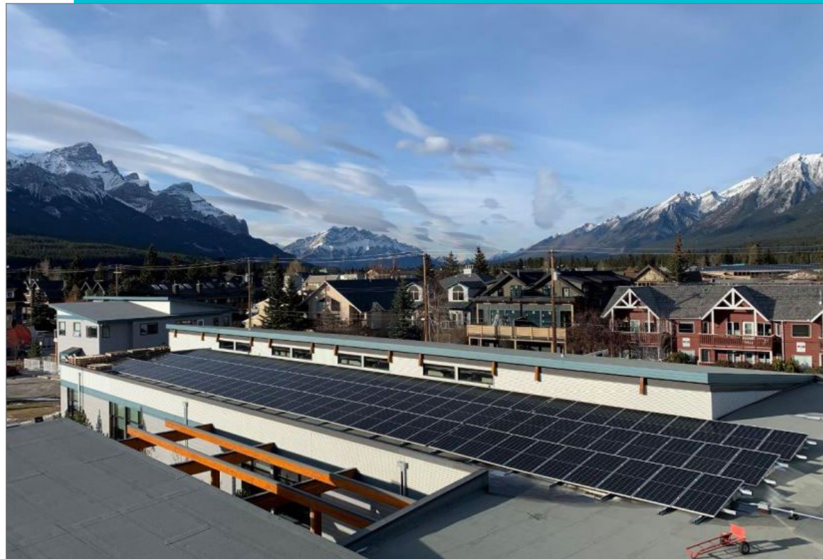
A portion of the solar PV array at Lawrence Grassi Middle School.