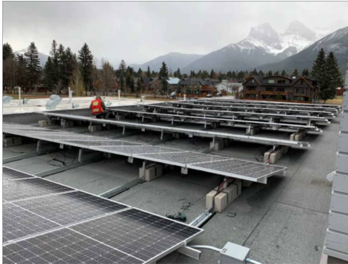
Ballasted solar PV array at Lawrence Grassi Middle School.